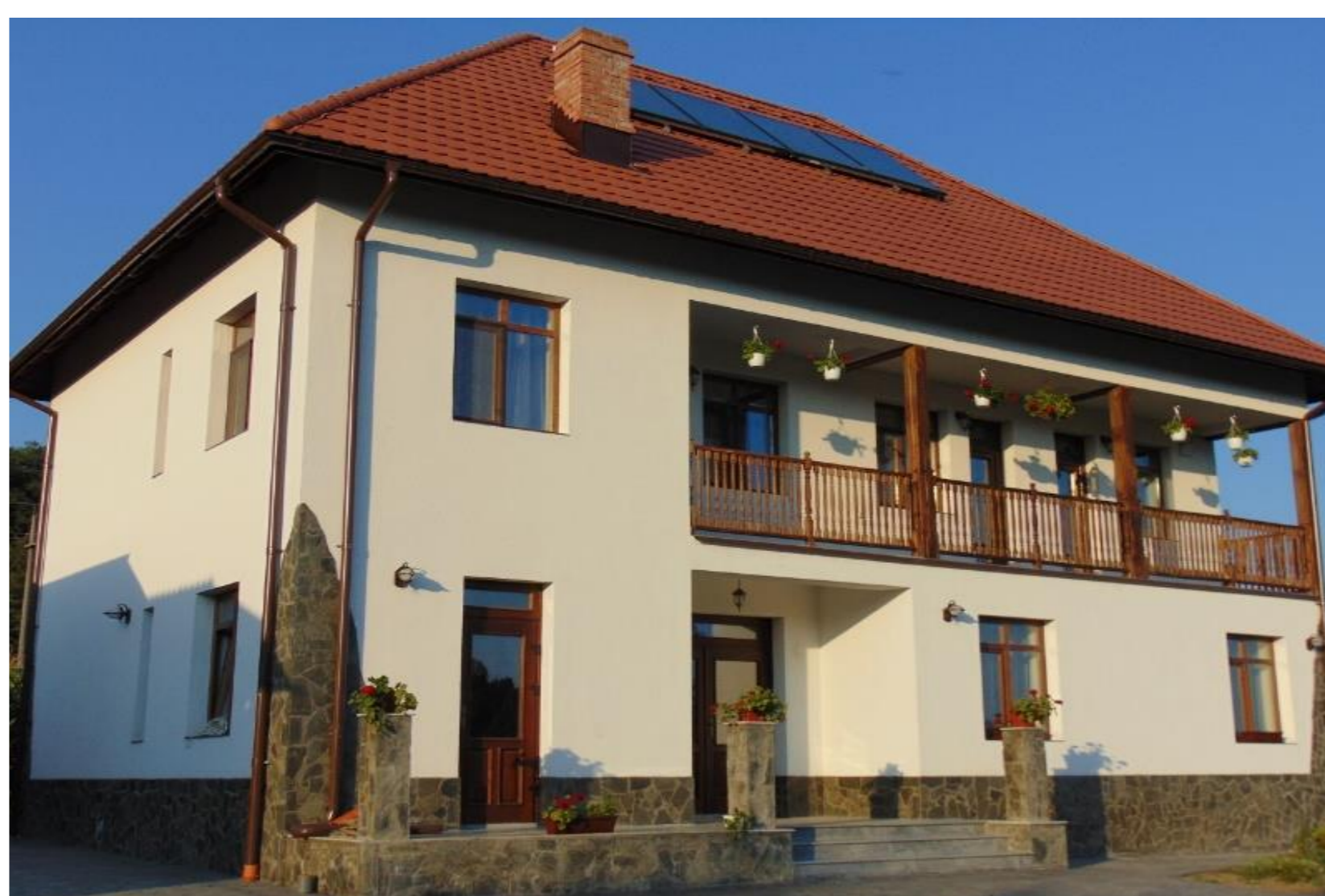
Figure 2. Vaideeni Pension