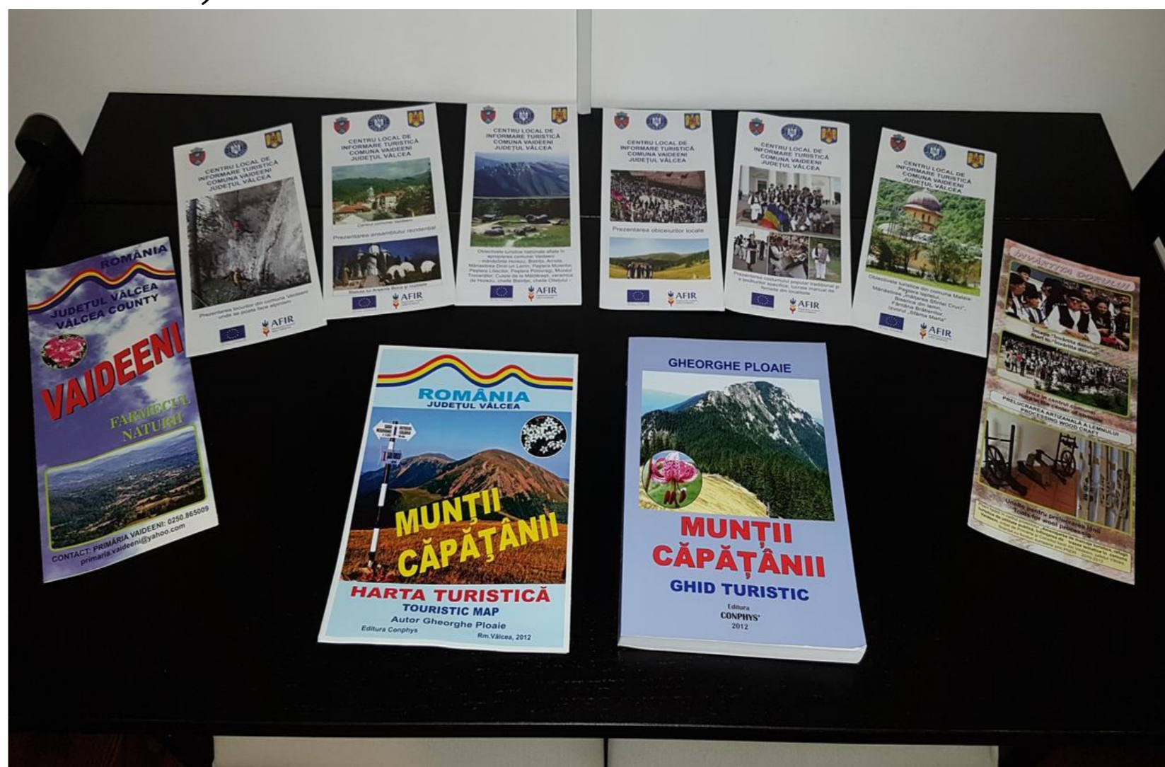
Figure 1. Vaideeni commune promotion and Vaideeni pension

The firm S.C. "Pensiunea Vaideeni" S.R.L. was established on 30.06.2015, proposing the establishment of an agro-tourist pension by accessing european funds, through the National Rural Development Program 2014–2020, sub-measure 6.4.