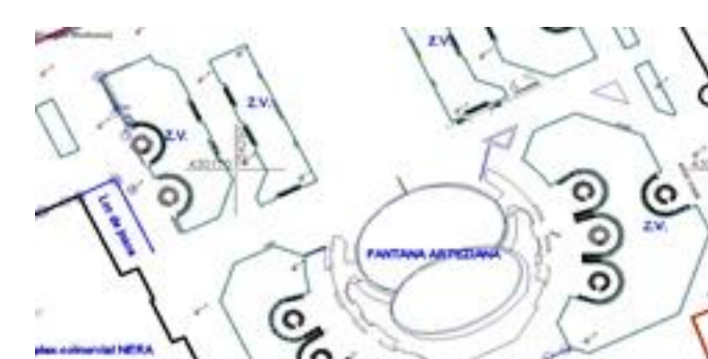
Figure 3. Arrangement of buildings networks towards green spaces

The data taken from the Topo-geodetic survey activities were imported into the DraftSight program, with their help it was possible to form a graphical plan of the measured areas, the data is divided into "layers", these layers are categorized in order to make the process of digitization much easier for the responsible person, for example: you can create a layer only for roads, or a layer only for a certain type of tree, etc. (figure 2).