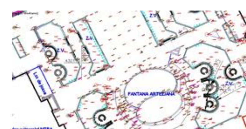
Figure 5. The making of the elevation plan with of the afferent area